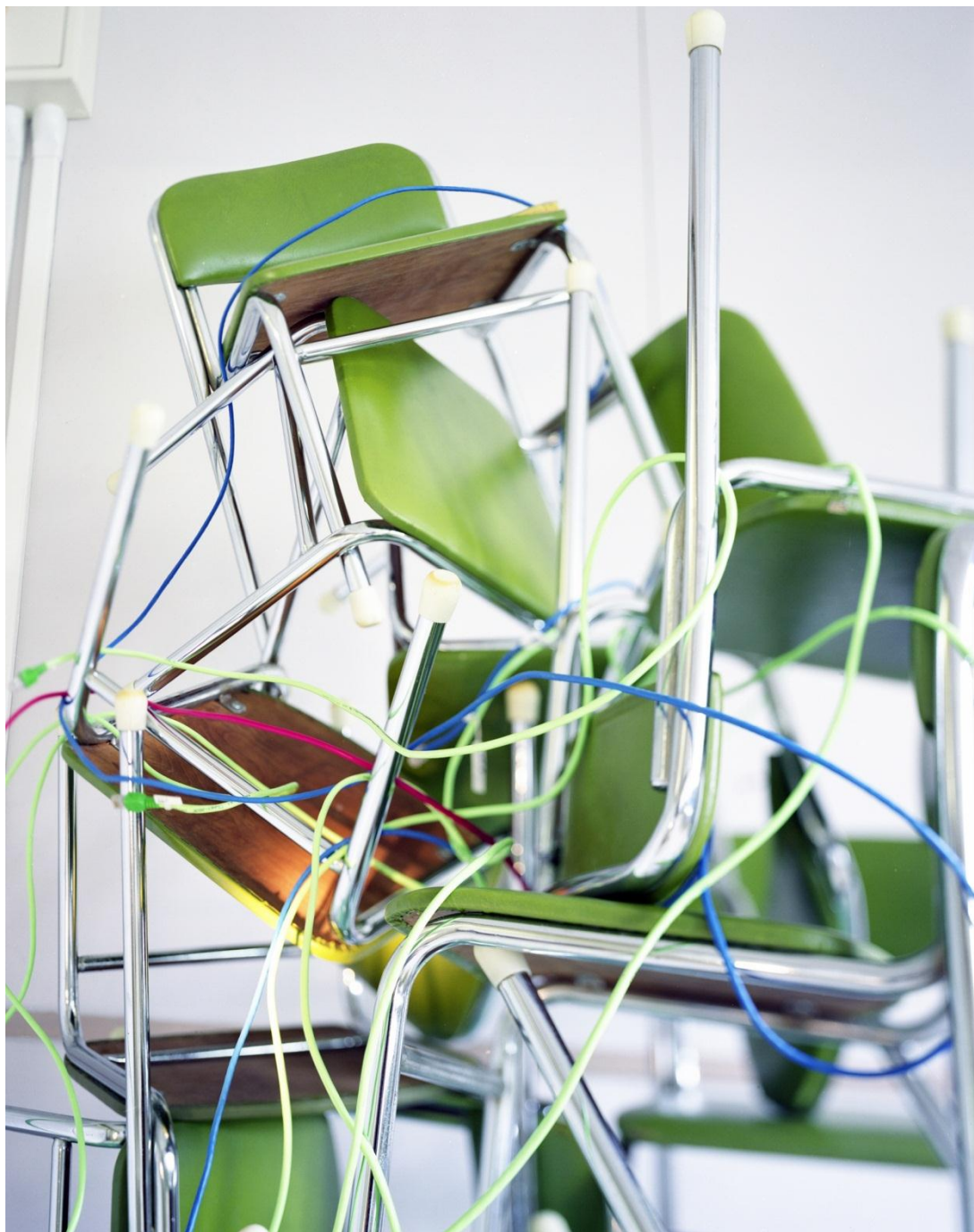
Tanaka Kazuhito "Untitled Composition" 2010-11, color photograph

Email: info@makifinearts.com Tel&Fax : +81-(0)3-3669-7501